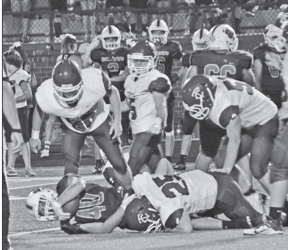
The Towns County defense makes a stop at Gilmer during the Aug. 30 contest.